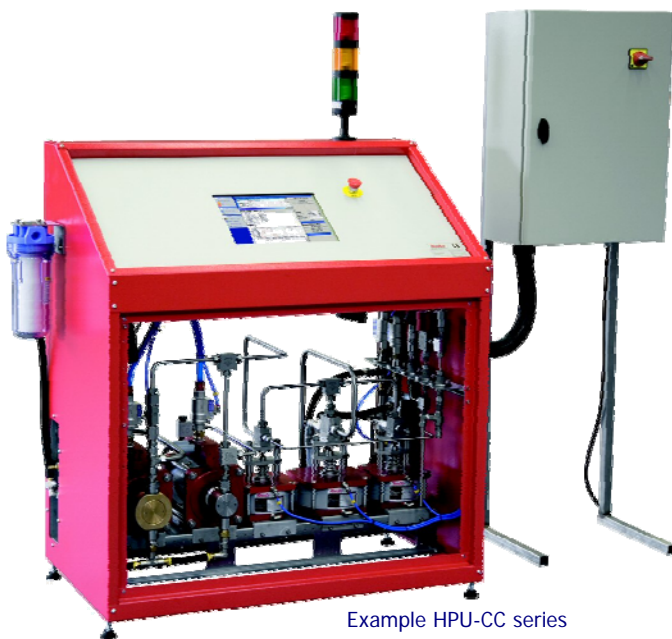
Example HPU-CC series

Resato computer-controlled test units that can be integrated into your own test compartment or test bay. Pressure range: 2000 – 4000 – 7000 – 10000 bar